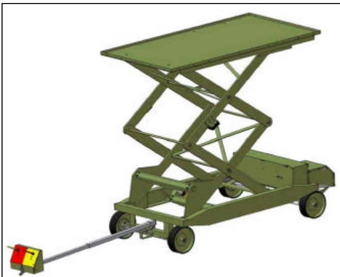
EOD Cart, Extended Position

The cargo deck is 30 in (76 cm) wide by 60 in (152 cm) with a perimeter lip with anchor points every 6 in (15 cm).